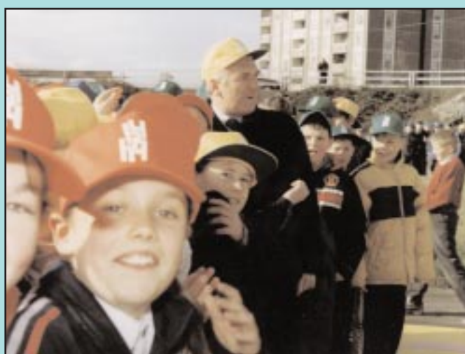
An Taoiseach, Bertie Ahern, TD, wearing the colourful Arts & Community Resource Centre yellow cap with pupils from Holy Spirit Girls & Boys National School, Scoil an Tseachtar Laoch, Virgin Mary National School and St Joseph's National School.

B allymun Arts and Community Resource Centre team was delighted to welcome An Taoiseach, Bertie Ahern, T.D. and Sile De Valera, TD, Minister for