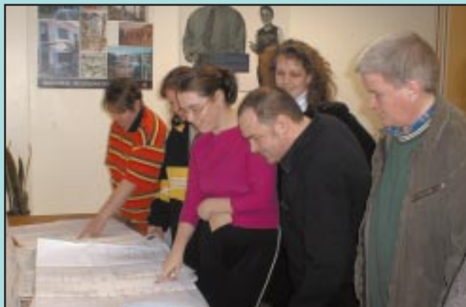
Residents at the Transition Programme.

Residents have given their enthusiastic approval to the Transition Programme which is held every Monday, Tuesday and Wednesday evening for people moving into new homes. It is specially designed to help residents cope with regeneration and should help to build communities in the new neighbourhoods. The programme: