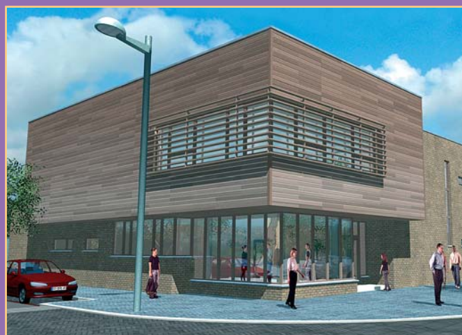
Central Youth Facility Centre, Sillogue Road. (Expected to start on site this Autumn 2004)

Neighbourhood Centres will be focal points for local communities; offering crèche facilities, shops, forum offices, meeting rooms, and other commercial services. Workshop spaces are also included in the Poppintree centre. Apartments, are being built as part of the centres in Coultry, Poppintree and Shangan and these will be sold to private people wanting to live in Ballymun. Two of the new neighbourhood centres are currently under construction in Coultry and Poppintree. Shangan Neighbourhood Centre should be on site this Autumn. Hopefully Sillogue's centre, being built by Cluid Housing Association as part of their new older people's residential scheme, will also go on site in the next few months as it is going out to tender shortly.