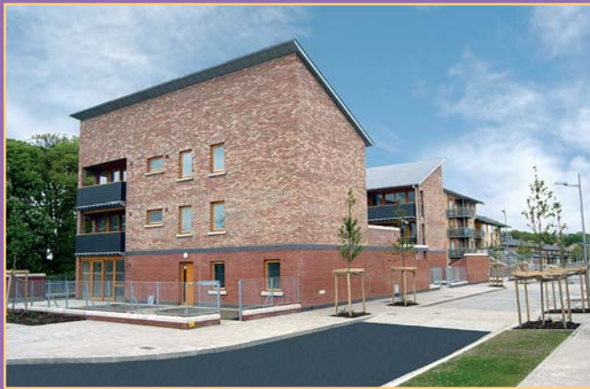
Example of Phase 2 housing complete and occupied.

This article focuses on progress in implementing physical regeneration projects. In the following newsletters, we will cover social and economic regeneration including topics such as local labour, childcare, education and training initiatives, art, history and cultural projects, environmental projects, sport and summer activities.