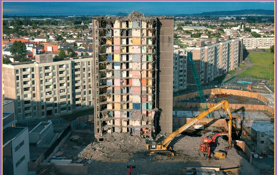
Demolition of Pearse Tower in progress.