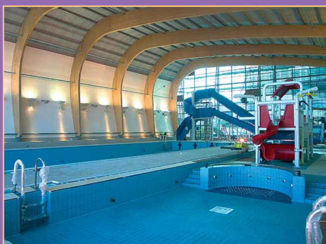
Interior of new swimming pool. (To open Autumn 2004)

The Leisure Centre, incorporating residential units, shops, a new public swimming pool and fitness centre, is expected to be open to the public later this year.