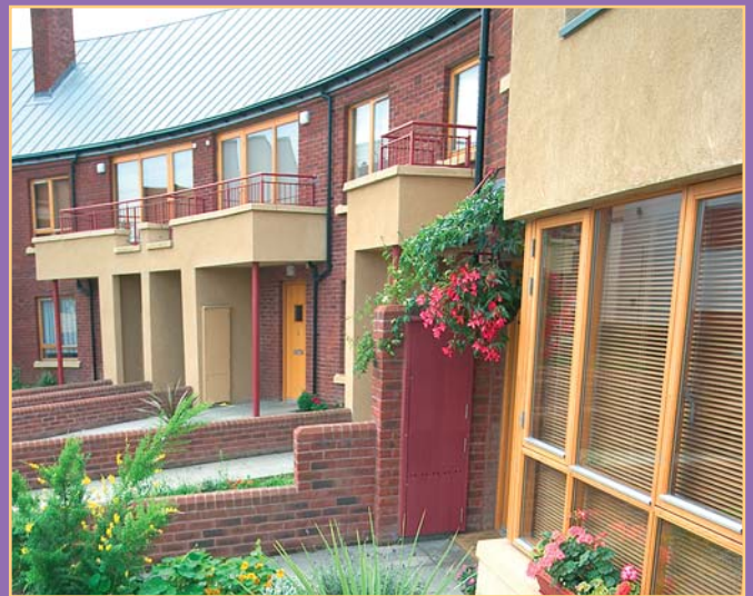
Example of Phase 1 housing complete and occupied.

But building the new Ballymun is not only about new homes. BRL has provided lots of temporary playgrounds over the years and two new permanent ones, at Sillogue and at Balcurris Park. Balcurris Park Playground, opened in May 2004, is divided into three distinct areas of play: a toddler section, a junior play area and a teen zone. The newest temporary playground cum community garden was officially opened in July 2004 between Connolly Tower and the first block on Sillogue Road.