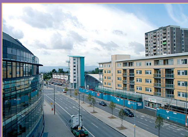
Progress in developing the new Ballymun Main Street. (Photo July 2004)

centre in the heart of each neighbourhood, rather than as places which cause concern because of anti-social behaviour.