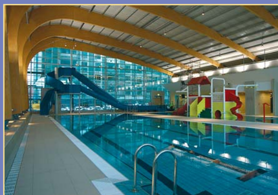
New pool (photo December 2004)