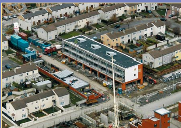
Coultry Neighbourhood Centre (photo November 2004)

B RL is keeping the promises made in the Masterplan to provide new community facilities including parks, pitches, playgrounds and buildings. An extensive network of facilities for community and voluntary groups is being provided for existing groups, so that they can continue to provide services; but there will also be provision for new organisations that want to get started in the area.