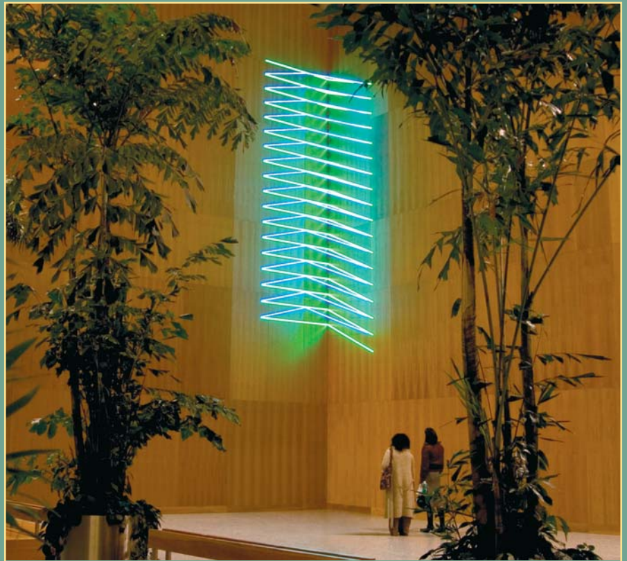
'ZIP' by Corban Walker in the Civic Centre atrium