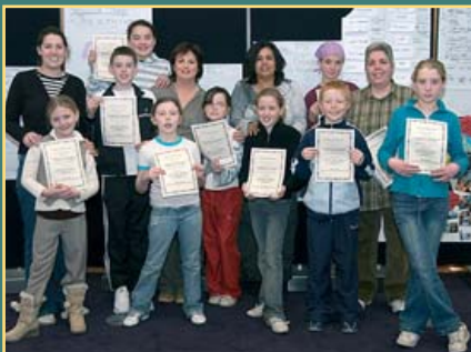
Children from Dane Road and Hollywell, who have completed the '2nd Regeneration Programme for Young People in Ballymun'

The four homes, two 3-bedroom houses and two 2-bedroom apartments, were constructed over the past year in partnership with Ballymun Regeneration Ltd, Dublin City Council, corporate sponsors, volunteers and the future homeowner families. Each partner family participated in all aspects of the build - learning new skills, participating in a homeowner-training course and building relationships with their new neighbours.