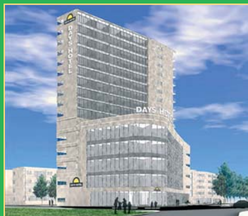
Days Hotel in Santry Cross is expected to open on 15th May, as part of the regeneration project

If you would like more information about these jobs call into Ballymun Job Centre. Telephone 01 866 7000