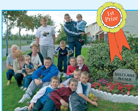
Belclare residents, Best Kept Area winners 2006