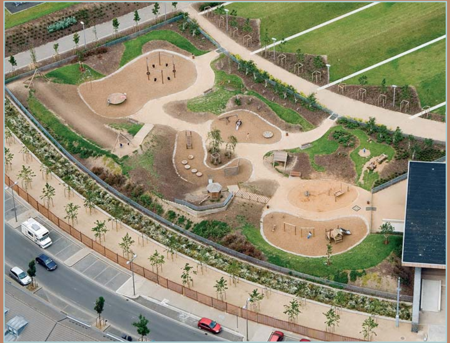
Coutry Park playground