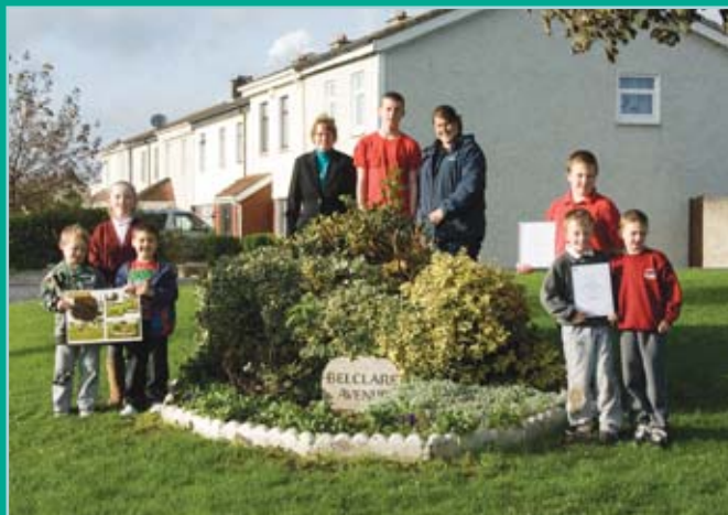
Residents of Belclare Avenue, winners of Best Kept Area in the Tidy Towns Awards.

the awards ceremony in the Civic Centre Council Chambers in September was to a full house!