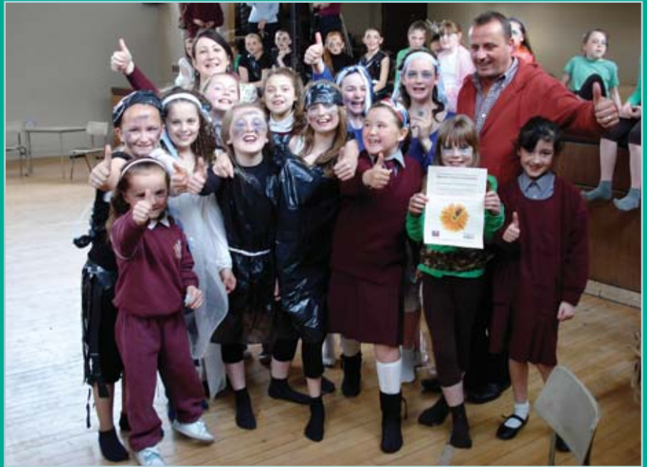
Virgin Mary Girls National School Green Team receiving their award for the Beautiful Schools Competition.