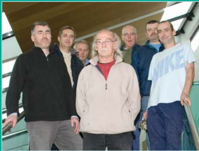
Award winning Furniture Recycling Project staff receive two Tidy Towns awards.

The project is one of several projects which highlight the value of waste and it is a pilot project for the proposed Rediscovery Centre.