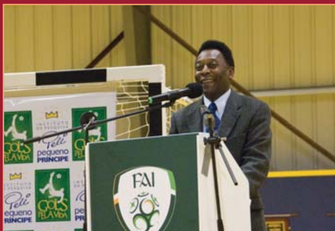
Pele at the BRL Umbro Arena, Ballymun

PELE, arguably the greatest footballer of all time, arrived in Ballymun at the BRL Umbro Arena on November 26th 2009 and it was all for the worthy cause of providing funds for his little princes programme for sick children, The "Goals For Life" campaign. This