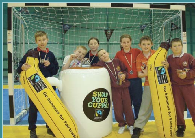
Winners of the Aisling Fairtrade Youth Football Tournament 2010