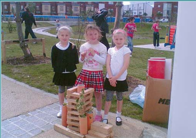
Local children enjoying the Whiteacre Park Playday

P lay is what children do naturally, what they like to do best and how they learn about life. Ideally we would all love our children to play in a wonderful