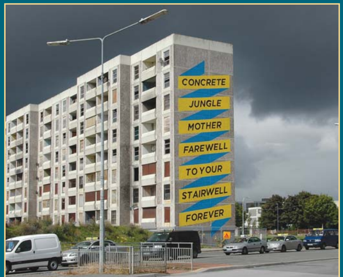
Eight storey high mural by artist Maser located at Silloge Road

find more information on this project by logging onto www.theyareus.ie .