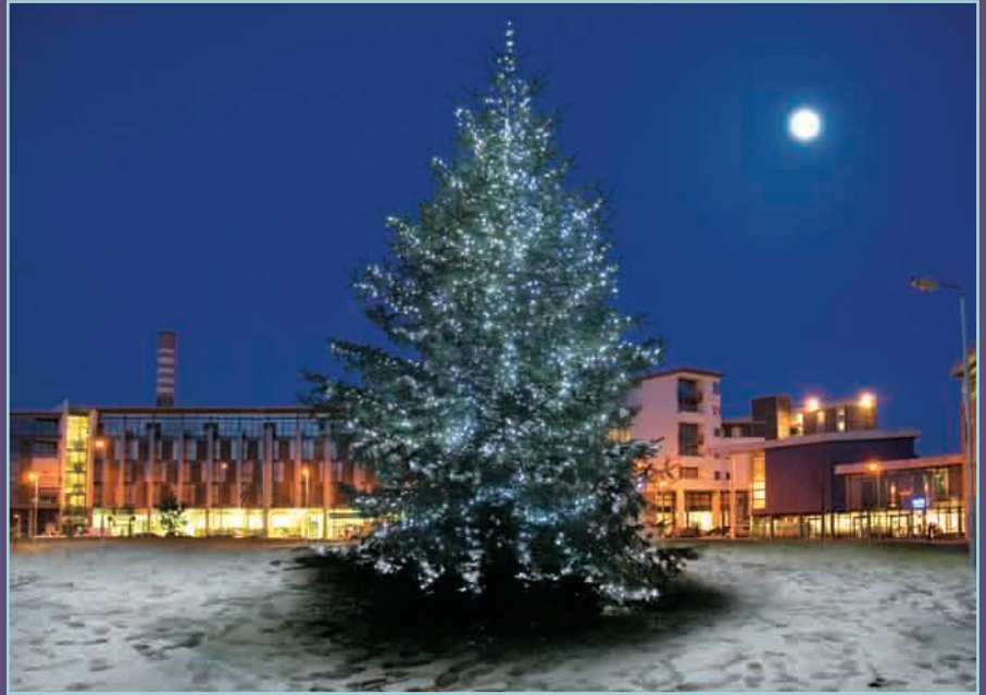
A very happy Christmas and best wishes for 2011

If you see anything of a criminal nature i.e. vandalism, burglaries or thefts, please contact the Ballymun Gardai at 01 666 4400