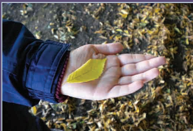
One of the top three winners of Ballymun Framed 2011

To request a copy of the calendar contact GAP @ 01 862 5846.