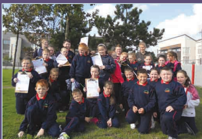
Pupils from St. Joseph's Senior National School complete the new Balcurriss Park Nature Trail

Between December and February each year, Bird Watch Ireland ask members of the public to keep note of the highest number of each bird species visiting their garden every week. We also ask for information on the size of the garden being surveyed, the kinds of food, if any, being offered to the birds. Taking part is fun, easy and an ideal