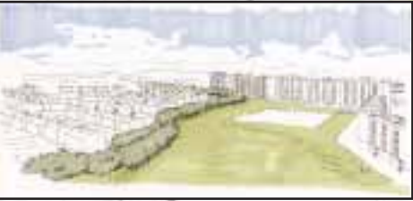
Existing open space behind Pinewood Drive.