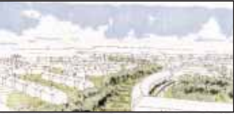
Proposed open space behind Pinewood Drive.