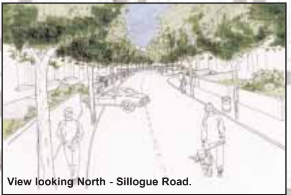
View looking North - Sillogue Road.